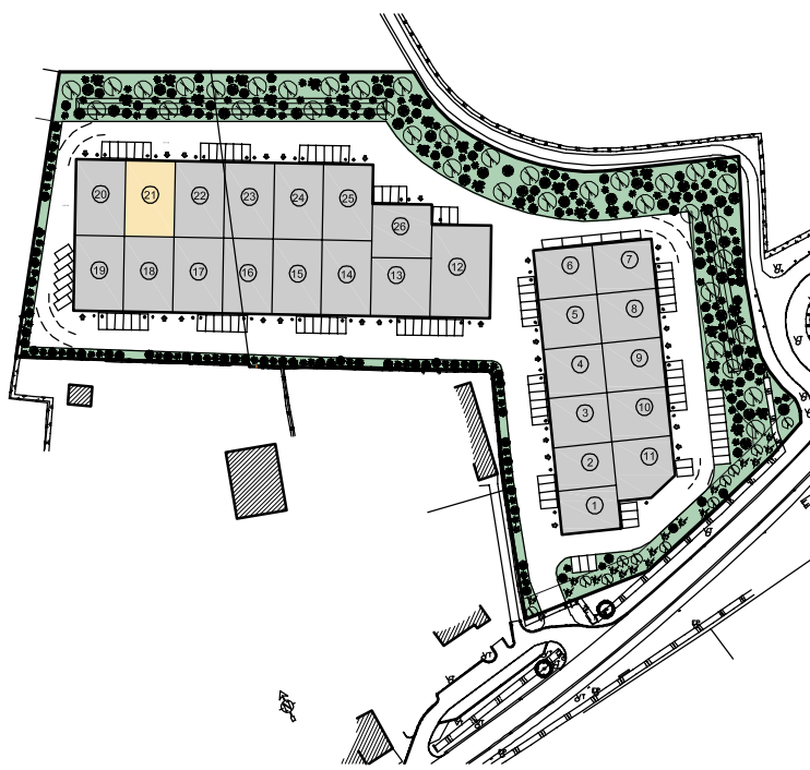
Overzichtsplan schaal 1/2500